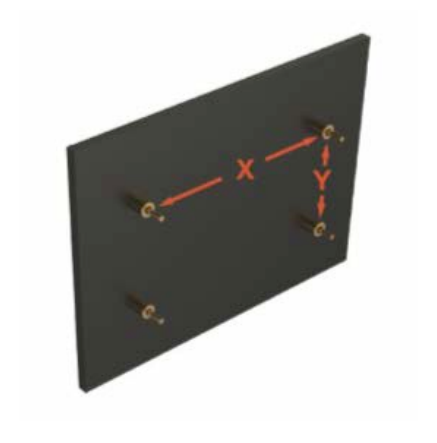
Flat Back Suitable for installation on flat surface on the ground.